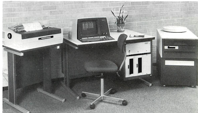
A Typical 2200 MVP System Configured with Optional Peripherals