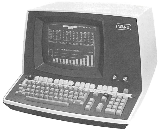
Model 2236DE Terminal

Additionally, the 2200MVP supports a wide range of other peripheral devices. These devices include a selection of flexible and hard disk drives, and an extensive array of printers and plotters. To support these peripherals, the 2200MVP chassis contains nine input/output (I/O) slots; the 2200MVPC chassis contains seven I/O slots. Each I/O slot can contain a controller, capable of controlling one or more peripherals.